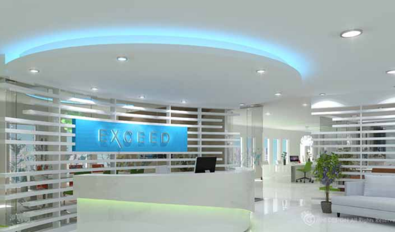
Exceed IT Services, Knowledge Village Dubai