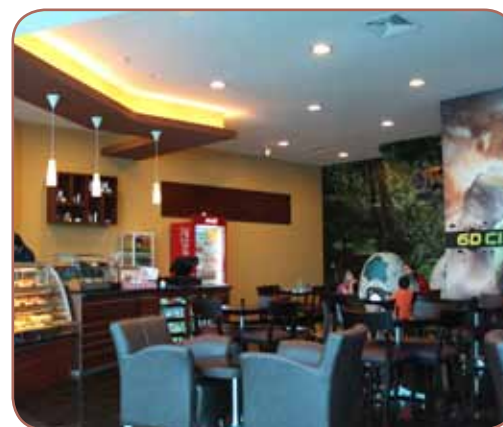
Thrill Zone Dubai