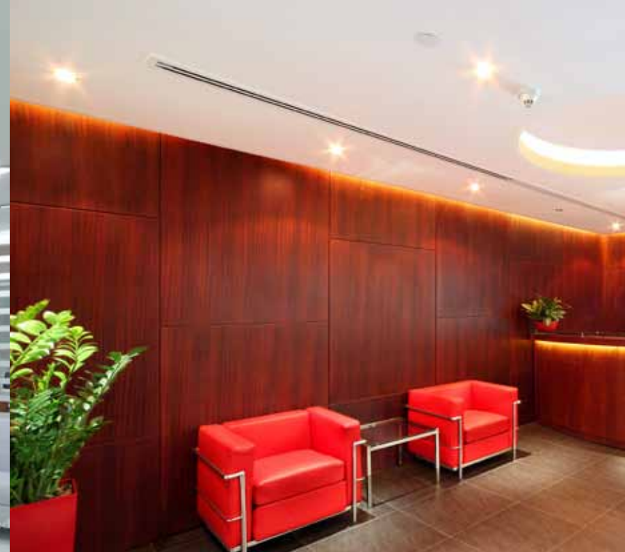
ADP, Concord Tower Dubai