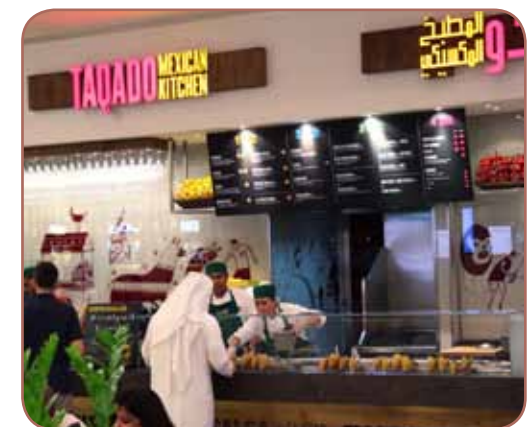
Taqado Mexican Kitchen Mall of the Emirates, Dubai