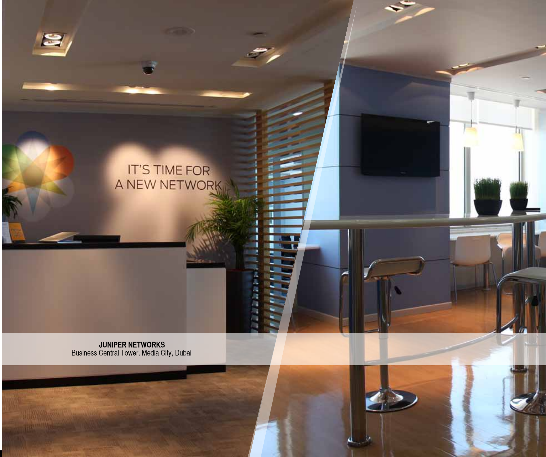
JUNIPER NETWORKS Business Central Tower, Media City, Dubai