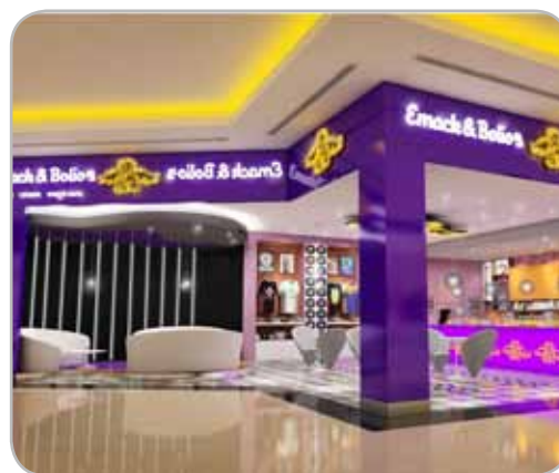
Emack & Bolio's Abudhabi